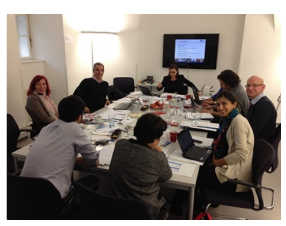
UNIBILITY project partners working on the structure of the Reader "From CSR to USR"

The first output of the UNIBILITY project is the READER "From CSR to USR", which is about to be finalized and will be online on our website for download by February 29, 2016. The Reader is a