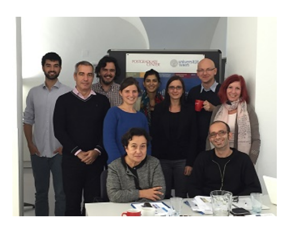
UNIBILITY project group at the kick-off meeting in Vienna – October 2015

Universities increasingly strive strengthen their public commitment to the city they are located in, to the local economy and to the wider society through their research and higher education activities, in order to have a real impact on their local communities and improve the relevance of higher education in society. In 2015 a joint between five project European universities was launched to explore this topic - coordinated by the University of Vienna, Postgraduate Centre (Austria) funded the and by Erasmus+ Programme of the EU.